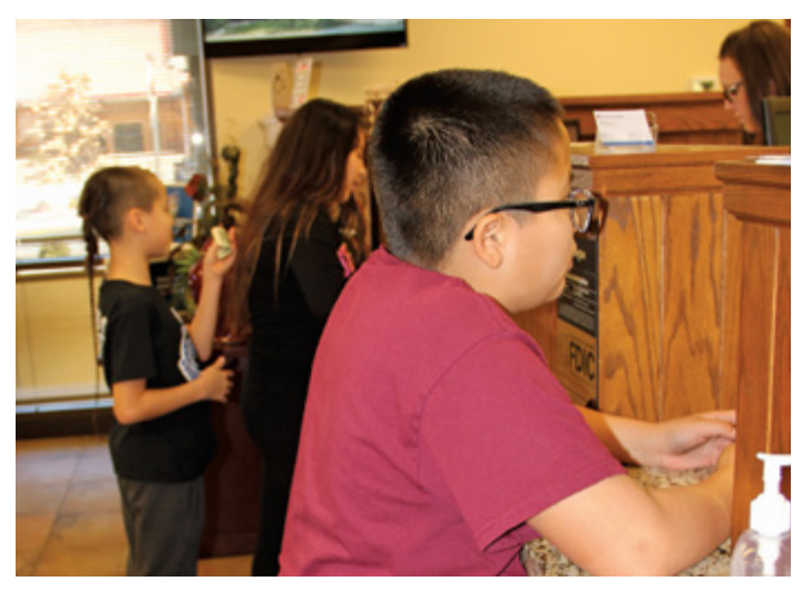
New Kituwah Academy students making deposits at First Citizen's Bank.