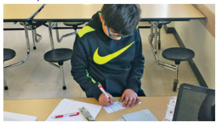
Student depositing funds at Napi Elementary during school banking hours.