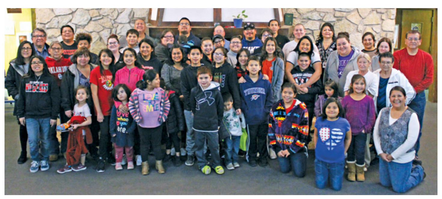
2019 ONAC Children's Savings Account opening event with youth from the Kiowa Tribe Head Start Program.

Gallup Central High School serves student parents through a Graduation, Reality, and Dual-Role Skills (GRADS) program (a class for student parents). Through this project, students enrolled in GRADS